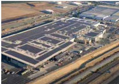
An aggressive schedule and the need to meet strict hygienic standards led designers at this 640,000-square-foot citrus processing and packaging plant in Delano, Calif., to specify a structural precast concrete system including architectural panels.