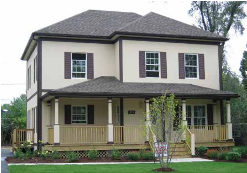
This residence in Bensenville, Ill., features a total-precast concrete structural system and insulated precast concrete panels. The home's traditional design belies its state-of-the-art features, such as radiant heating and a highly durable and sound-resistant shell that works well near O'Hare International Airport.